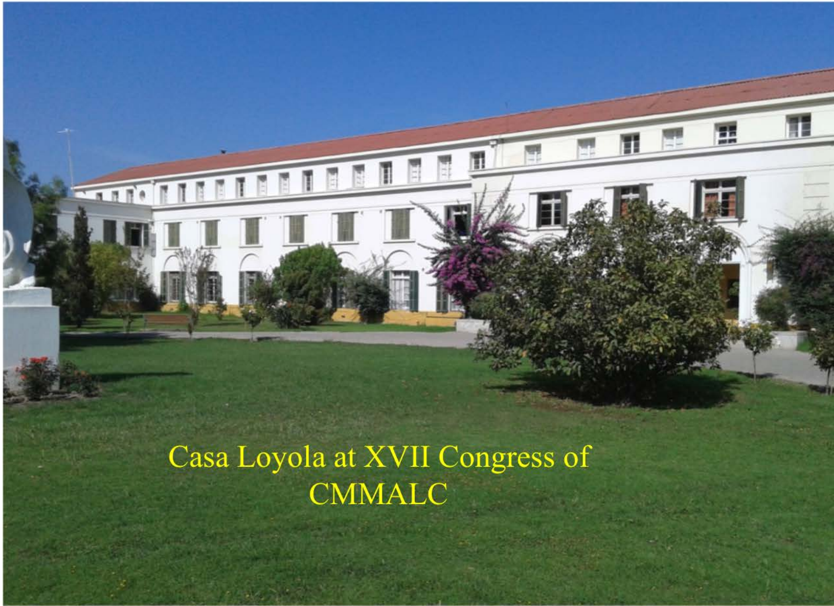
Casa Loyola at XVII Congress of CMMALC