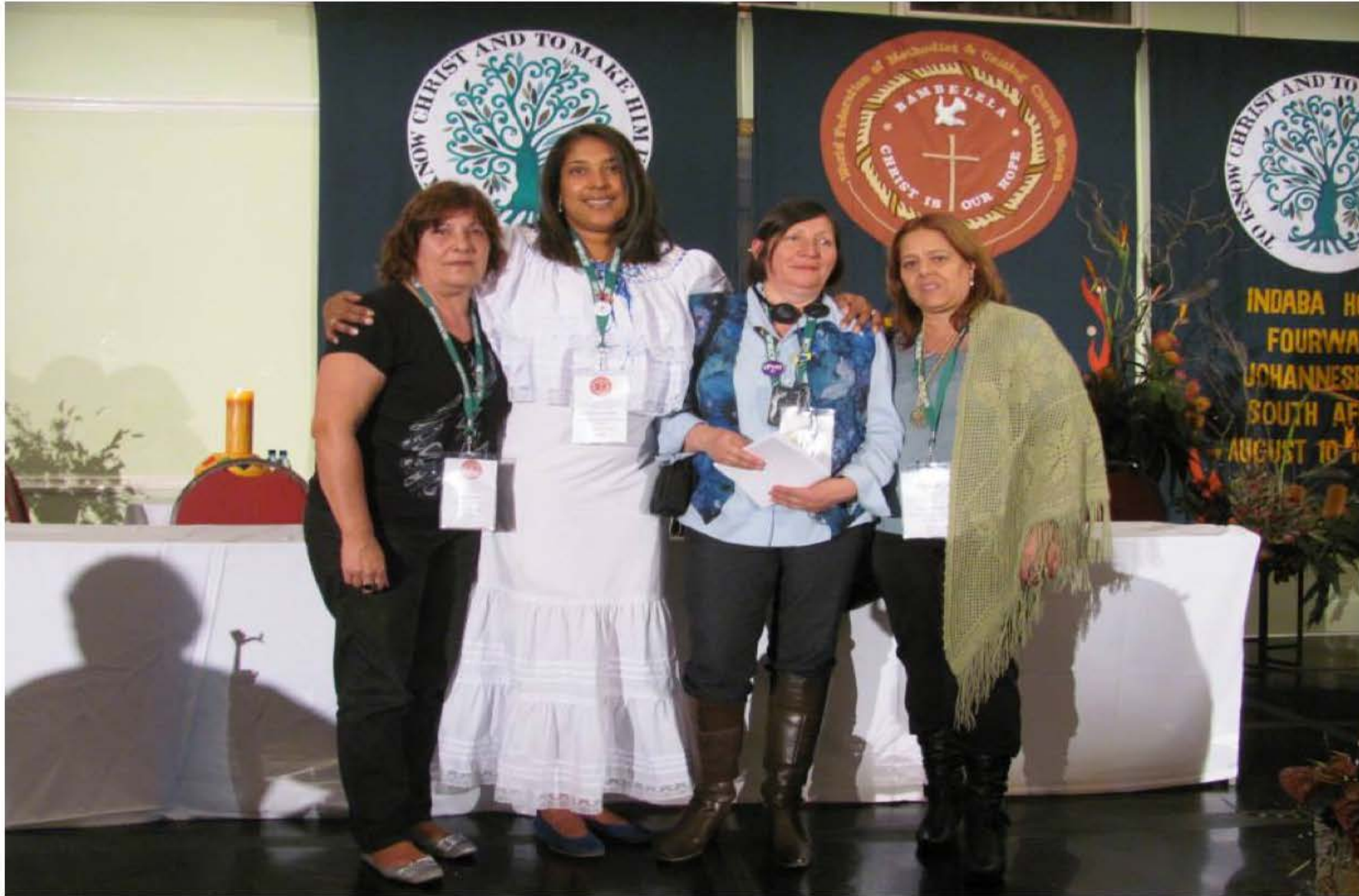
Quinquennium Moto 2011-2016