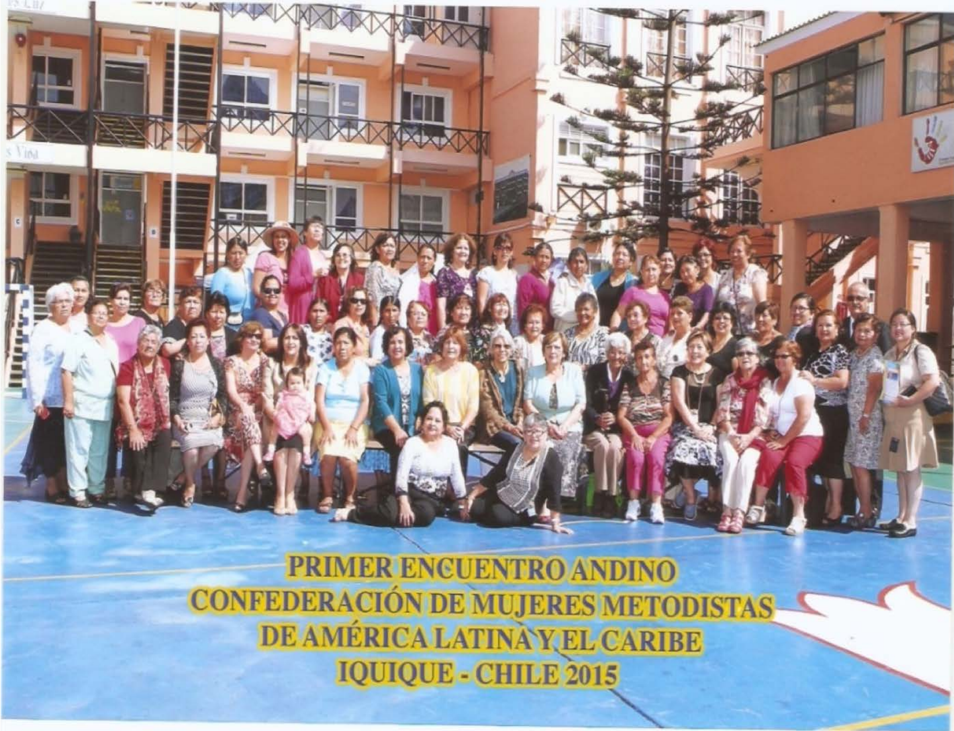
PRIMER ENCUENTRO ANDINO CONFEDERACIÓN DE MUJERES METODISTAS DE AMÉRICA LATINA Y EL CARIBE IQUIQUE - CHILE 2015